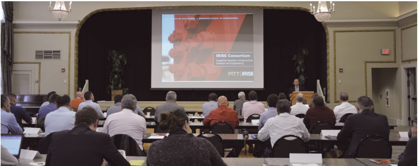
Transportation professionals gather for the first IRISE brainstorming session.