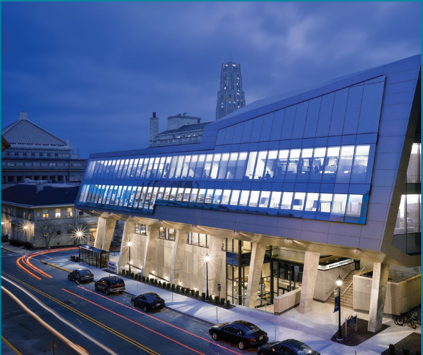
Benedum Hall houses Pitt's Swanson School of Engineering.